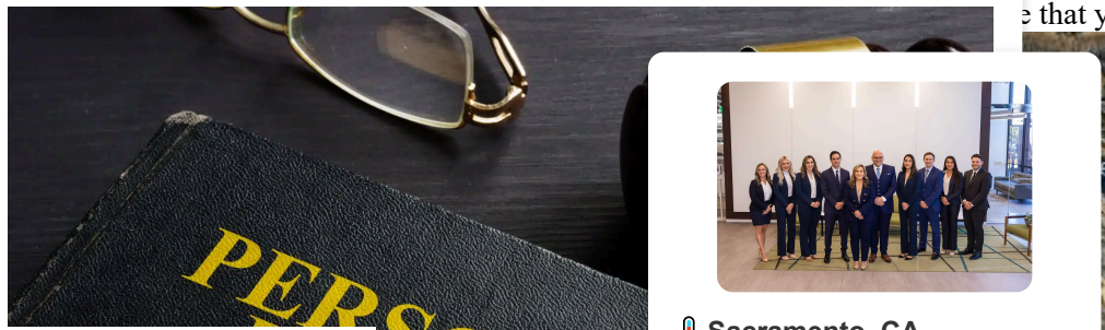
Sacramento Accident Lawyer