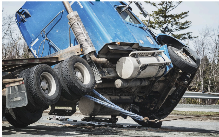
The Best Chicago Accident Lawyer

a years to mentoring youth sporting s. First, holding the irresponsible chauffeur s are most likely to work out caution when