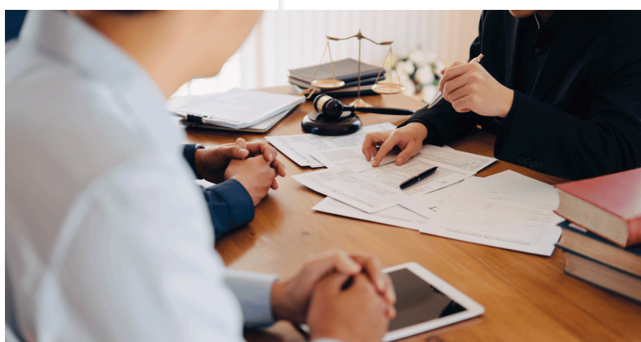
The Best Albuquerque Accident Lawyer

They understand all the techniques insurer use to try and deny your claim. You deserve much more. Most of accident legal representatives work on a contingency charge basis, suggesting that there are no out-of-pocket expenses made use of to pay lawyer fees, which commonly ranges from 25% to 40%. A discomfort and suffering calculator is just the very first step. Real value of your claim is determined by a lawyer.