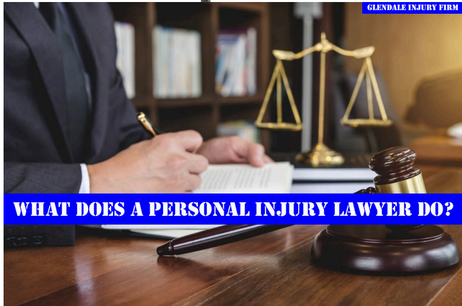
GLENDALÉ INJURY FIRM