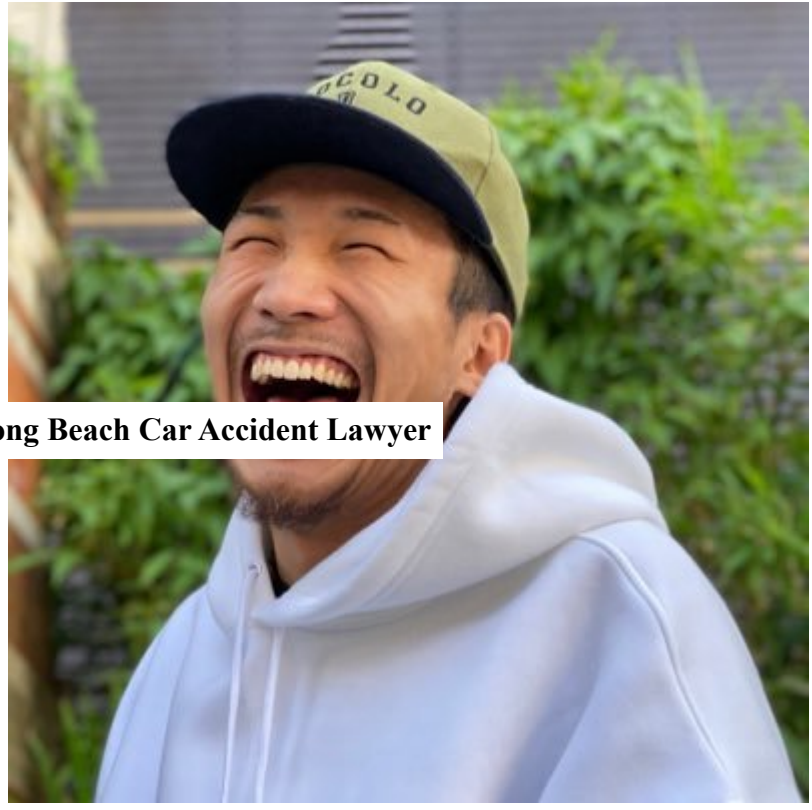
Long Beach Car Accident Lawyer