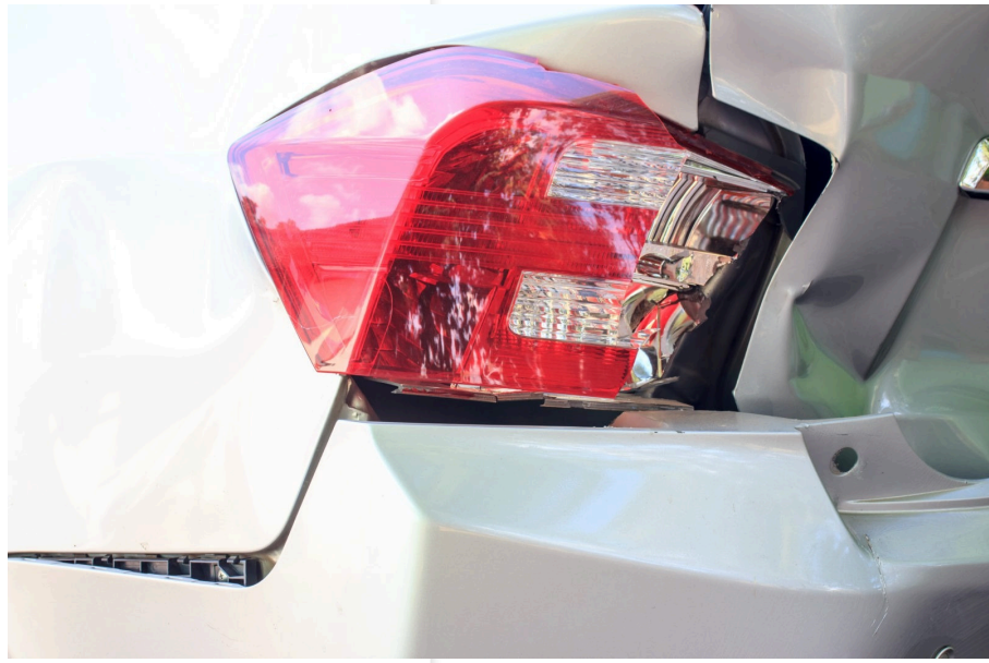
The Best Lakeway Accident Lawyer