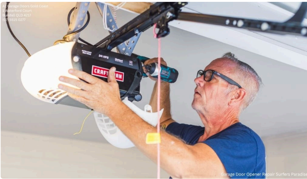
Garage Door Opener Repair Surfers Paradise