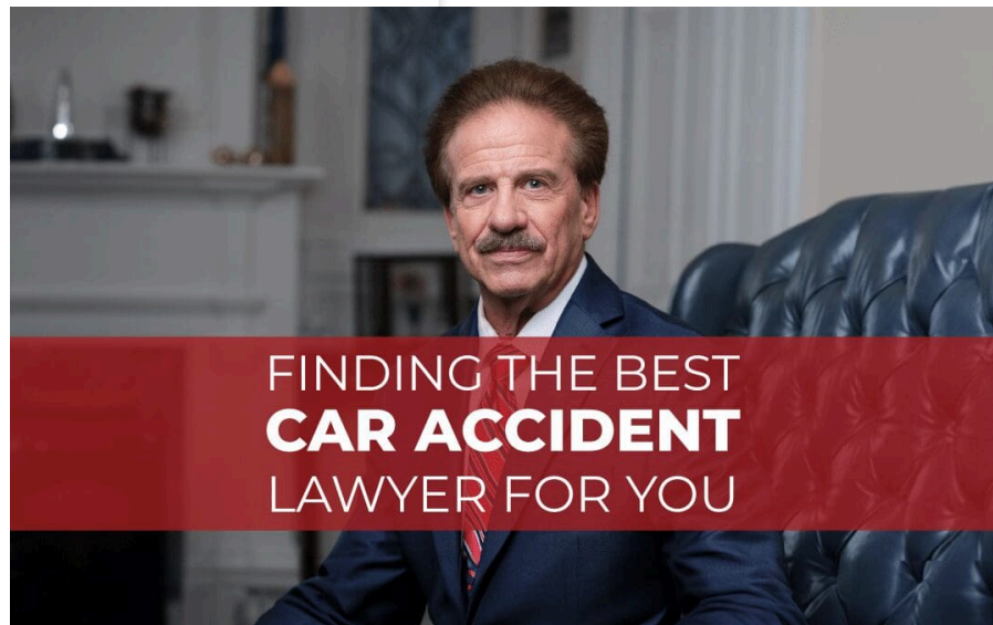
The Best St. Petersburg Car Accident Lawyer