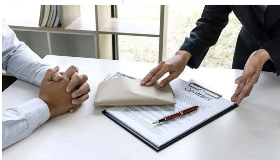
The Best Tarzana Car Accident Lawyer

The prosecution should verify the vehicle driver recogni from escaping obligation and to make sure injured indiv vehicle mishap, your household can file a wrongful fatal need to contact the insurance provider right after the acc insurance provider can link your injuries to this particul report and might test your insurance claim. To compute victim.