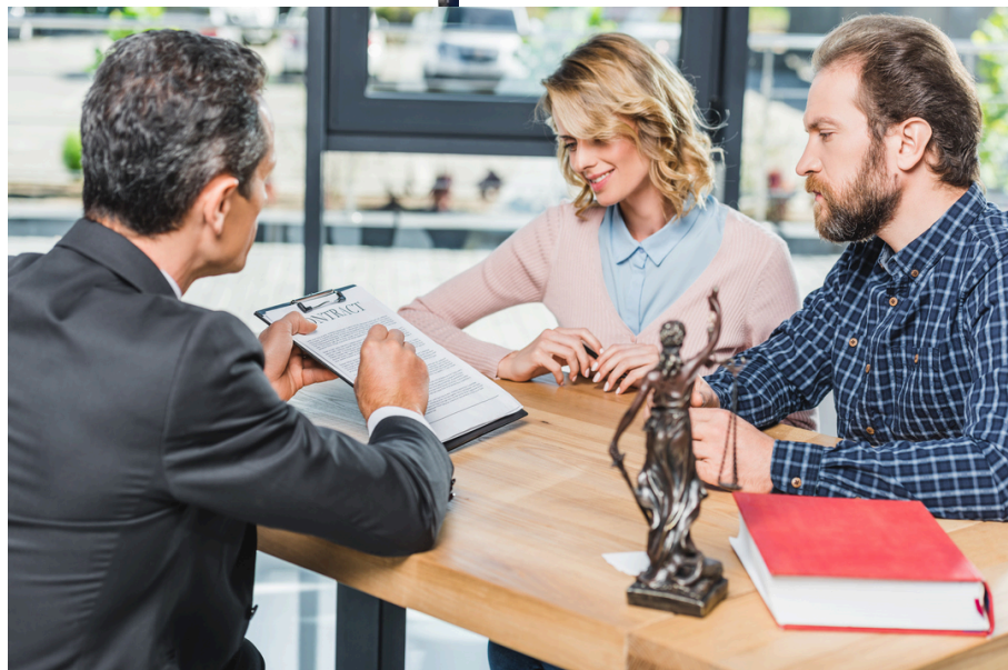
The Best Real Estate Lawyer