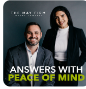
Long Beach, CA