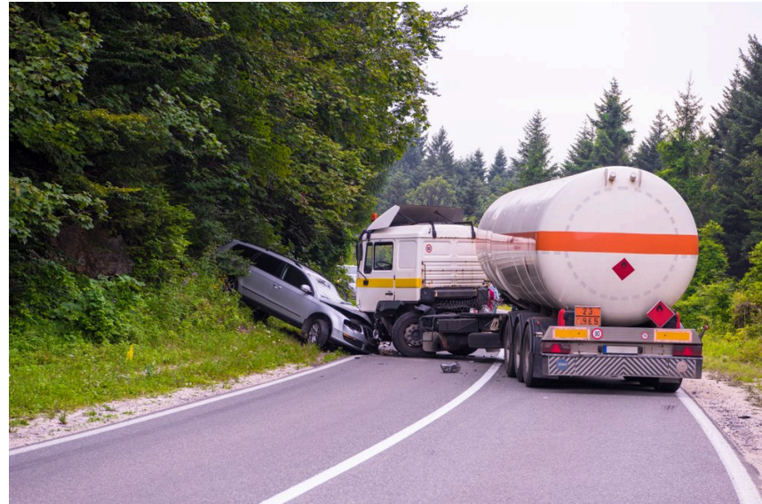
The Best Long Beach Accident Lawyer