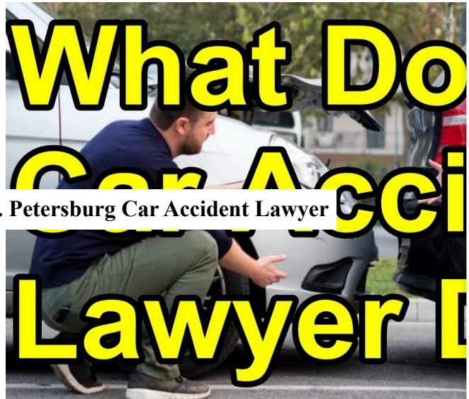
St. Petersburg Car Accident Lawyer

ous training to guarantee their drivers comply with security protocols pany forgets this obligation, and an untrained or poorly supervised discovered responsible for irresponsible guidance. Nonetheless, it is plies when the driver is doing tasks that are straight associated with pe of their job responsibilities-- such as running an individual task y may not apply.