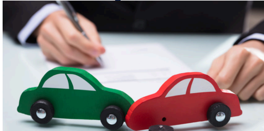
The Best Oceanside Accident Lawyer